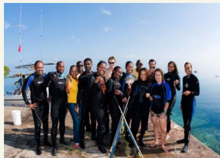
Recipients of the first train-the-trainer programme which focused on NEPA and the Fisheries Division

Discussions are also facilitated on how to relay the information received to different stakeholder groups and the requirements for follow-up on dissemination of information based on training received.