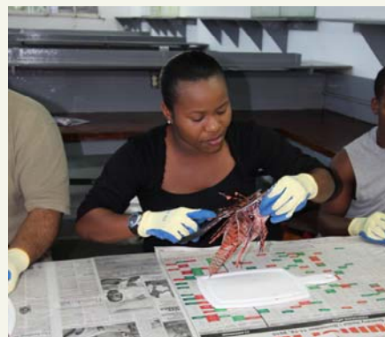
Participants removing spines during hands on laboratory segment of training

tice sessions using SCUBA techniques. The participants then return to the classroom for video review of SCUBA session to identify shortcomings and reinforce good techniques. Participants then receive instructions on preparation of the Lionfish followed by cooking and eating.