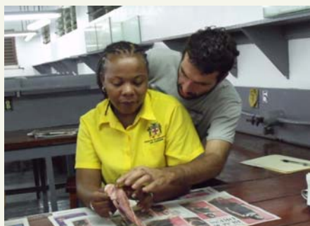
A Fisheries Officer showing the lionfish after the spines have been removed

The programme is hands on and teaches participants proper techniques of handling the species. This includes how to handle a lionfish to minimize risk, spine removal and disposal.