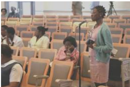
Photograph 4: Question from the Gleaner