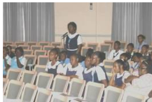
Photograph 5: Students asking questions

This section created much enthusiasm among the participants and inspired many interesting questions posed by the students. This segment had to be discontinued, as the time did not allow for the full exploration of the facts presented. However the information conveyed proved beneficial to all.